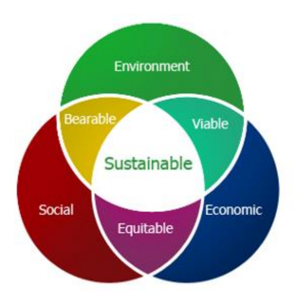
Figure 2:-Relationships in sustainable development- environmental, social and economic concerns.

Based on the pillars- economic, environment, cultural, political and social sustainability. It can be acquired by striking a balance between these