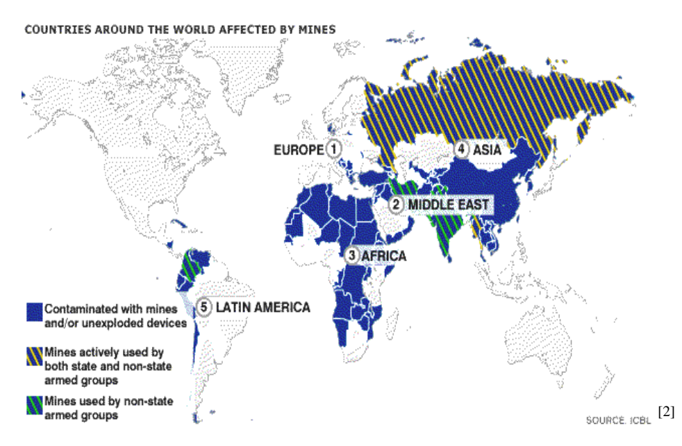
Figure (a) countries around the world affected by mines

different sides. Thus the use of map and making strategies became an obsolete war technique and the soldiers started to set up the landmines in abundance because there were variety in mines and one can easily purchase them. It is certainly true that landmines are one of the 'lowest-tech' weapons available today: one common example, the Chinesemade Type 72A has only one moving part, and there is no precision engineering or rocket science required of the sort needed to machine a rifle bullet. Furthermore, because of their low technology landmines are easy to store compared to some more complicated weapons which one can barely move, and usually require nothing more than a shovel to emplace just because they were very cheap mines were used in very heavy amount in 20<sup>th</sup> century and till now, but as the time passes the air vehicles did the transportation of mines so they were no mapping and marking of mines. The self-destructive mines were developed which were known as the 'smart mines' but some of them were fail in the destruction thus they remain for infinite time and due to the climate change like cyclone, flood, rain shifted the landmines. So, without clear records and with the impacts of weather and time, clearing up the mess after a conflict became even harder.